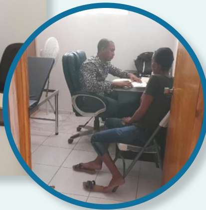
Left: Christian Community Clinic staff